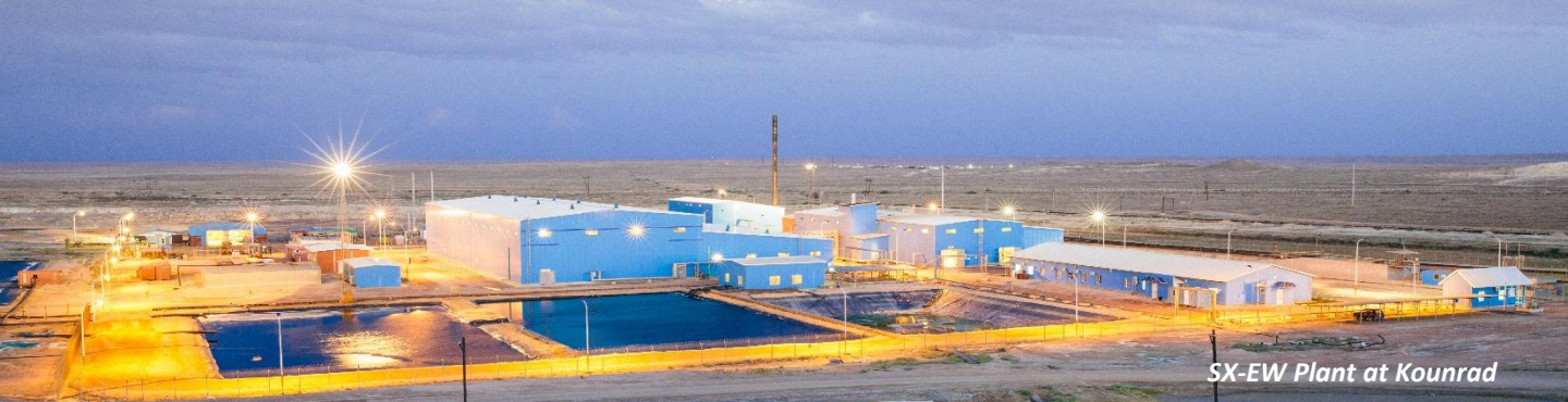
SX-EW Plant at Kounrad