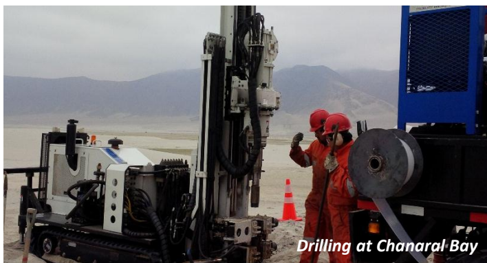
Drilling at Chanaral Bay

During 2014 the 136-hole 1,250-metre drilling campaign was undertaken, and a JORC-compliant resource report is expected in H1 2015. A PFS currently in preparation.