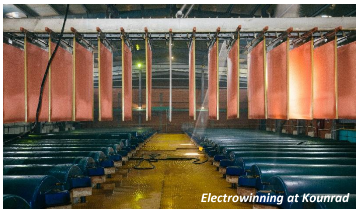
Electrowinning at Kounrad