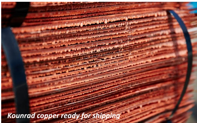
Kounrad copper ready for shipping

2014 saw record production at Kounrad, of 11,136 tonnes of copper cathode, with lowest quartile cash costs. CAML has a 2015 production target of 13kt of copper cathode, and the $35 million expansion of the Kounrad plant to 15kt annual production by 2016 is on schedule and funded from internal cashflows.